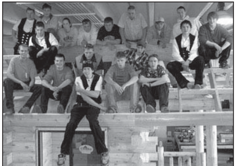
NorthCentral Technical College Residential Building Systems German building project.

While in Wausau, these students stayed with host families and experienced a little of our U.S. culture. The German and NTC students worked diligently to complete a building project during their visit. The building project that the students completed this year is a log style children's playhouse that will be auctioned to assist future NTC exchange travels to Germany.