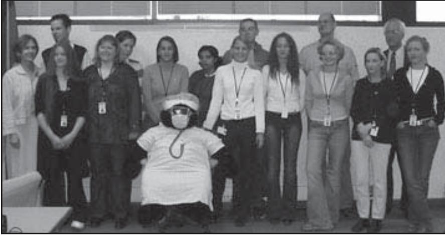
NTC's German nursing exchange group.

Northcentral Technical College, (NTC) hosted its first group of nursing exchange students from Frankfurt, Germany in March