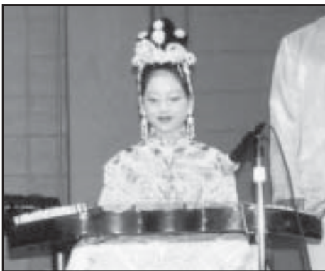
Chinese musicians perform traditional music.

Sinclair's International Education Committee conducted their second annual Global Awareness Week program the week of May 5. The purpose is to expose students to diverse cultures and engage students in programmatic discussions on global issues.