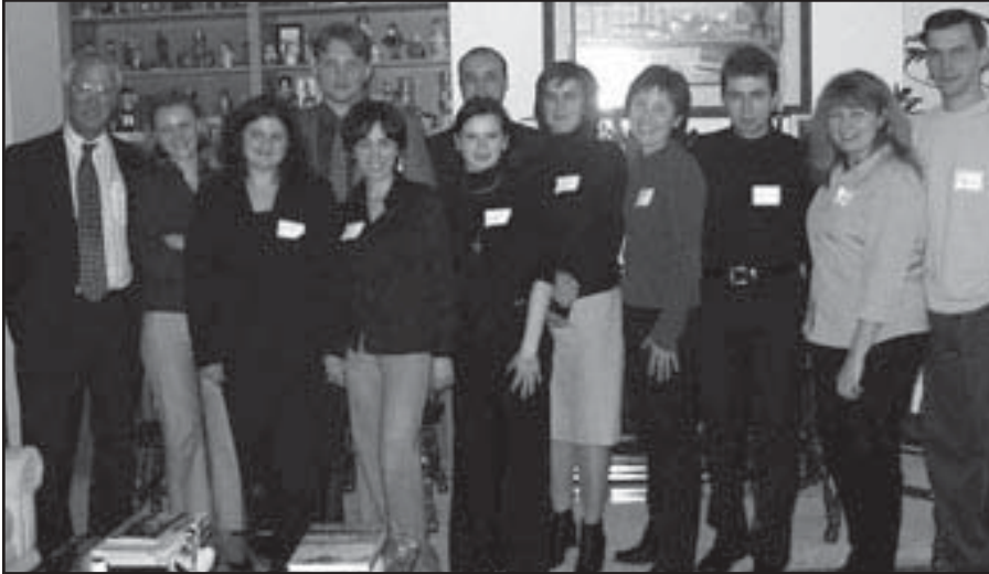
People who work with Disabilities Delegation from Zhytomyr.

Winter and spring were a rich time for different international events at Northcentral Technical College. Besides programs with Germany, Central American and Caribbean countries, the college has been running its seventh year of close and productive relations with Ukraine, under support of the U.S. Department of State. Through the Community Connections program, 10 professionals who work with people with disabilities from Dnipropetrovsk and 10 business people from Zhytomyr were hosted by our college and the community.