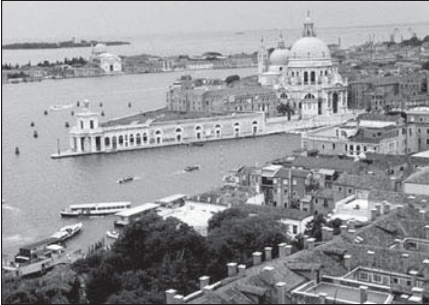
The city of Venice

“The Italian City as a Classroom,” CCID’s summer 2004 professional development program will be conducted in Italy, June 15 to 29. Some of the cities to be visited are Capri, Rome, Orvieto, Florence, Siena, Pienza, Montepulciano, Pisa, Lucca, Ravenna and Venice. Participants will see many famous cities renowned for their history and art. They will also be exposed to lectures on Italian history and art history, Italy’s political and educational systems and its economic development.