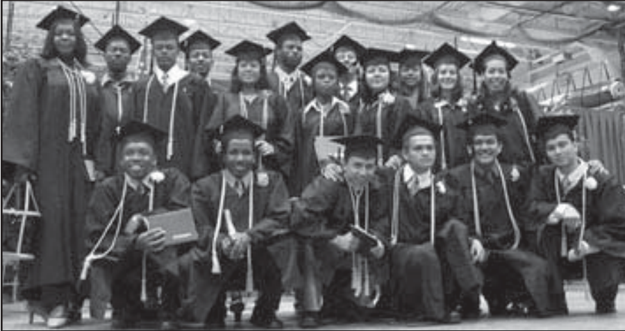
Cooperative Association of States for Scholarships 2003 graduation at NTC.

Eighteen young men and women from Northcentral Technical College's Cooperative Association of States for Scholarships (CASS) program through Georgetown University took part in the spring commencement ceremonies on May 22, 2003. All students graduated with a 3.5 or higher GPA Gold Cord Award from the Industrial Engineering Technology Associate Degree program. Northcentral Technical College congratulates the CASS students on their hard work and dedication to setting a standard of academic excellence.