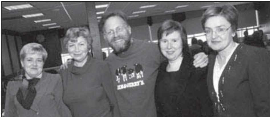
Russian visitors meet with Jerry Greenfield, co-founder of Ben and Jerry's Homemade Ice Cream, at Harford Community College.

From March 26 to April 4, 2003 Harford Community College (MD) hosted medical professionals from Moscow Medical College and Moscow War Invalids Hospital as a part of Harford's seven year partnership to aid nursing reform throughout Russia and the Commonwealth of Independent States.